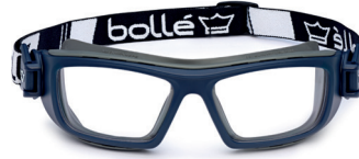
KOVER | TYPE: SEALED CURVE: 4 3 SIZES