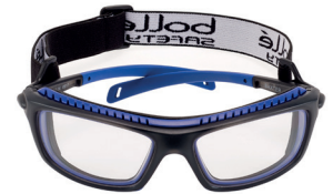
BAXTER | TYPE: SEALED CURVE: 8 1 SIZE