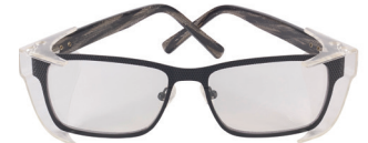
B713 | TYPE: METAL CURVE: 4 2 SIZES