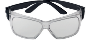
XTRA | TYPE: ESSENTIAL CURVE: 6 2 SIZES