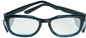
SPICY | TYPE: ESSENTIAL CURVE: 4 1 SIZE