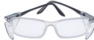
B809 | TYPE: ESSENTIAL CURVE: 4 3 SIZES