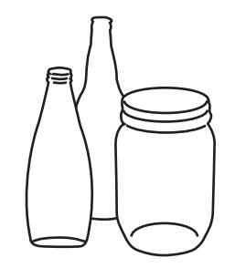
Glass bottles (triplerinsed and unbroken)