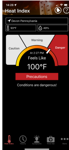
Figure 2 – NIOSH Heat App

7.4.3. NIOSH Heat Index App - The app uses your location and provides instant information on current conditions. The app also provides an hour by hour forecast of conditions and information on symptoms and first aid. A link to download the app for IOS and Android devices is included in the resources section of this program. Caution: values shown in the app reflect conditions in the shade. Direct sunlight can increase the Heat Index by up to 13.5°F.