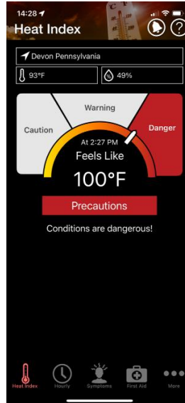
Figure 2 – NIOSH Heat App