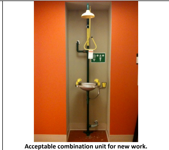
Acceptable combination unit for new work.

14.4 Existing Construction - The selection of free-standing eyewash stations are encouraged over sink placement because sink locations are frequently crowded and access to the eyewash can be hindered. When eyewash units are installed at sinks, those that swing across the sink should be avoided because these stations are often too large for small sinks. Deck mounted eyewash-drench hoses are recommended for these locations.